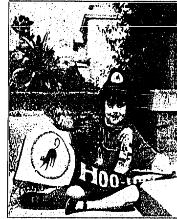
YOUNGEST AT THIRTY-SECOND ANNUAL

To arrange games, contests, hunting, and fishing trips, etc., which will bring together members who are fond of the same sports.